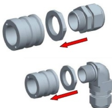
NAOBO application example